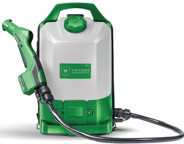
BACKPACK SPRAYER (VP300ES)