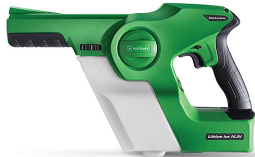
HANDHELD SPRAYER (VP200ESK)

Save time. Save money. More effective, even coverage.